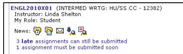
Figure 4 News items appear beneath a course in the myWebCT page.