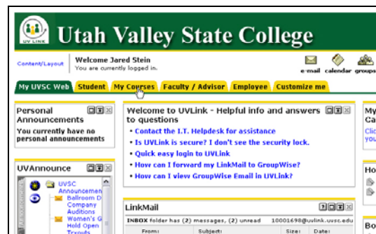
Figure 2 In UV Link click the My Courses tab.